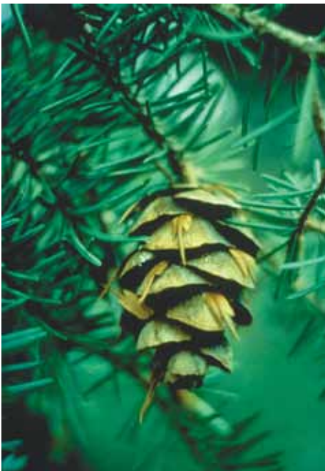
Figure 5: Douglas-fir cone ( Pseudotsuga menziesii )

Growing native trees does not exclude the use of adapted non-native plants. There are many non-native plants that are adapted to Colorado's climate and can be used in a native landscape as long as moisture, light, and soil requirements are similar. If a site has a non-native landscape that requires additional inputs (such as an irrigated landscape on the plains), dry land native plants can be used in non-irrigated pockets within the non-native landscape. These native "pocket gardens" can be located in areas such as parkways and next to hardscapes that are difficult to irrigate.