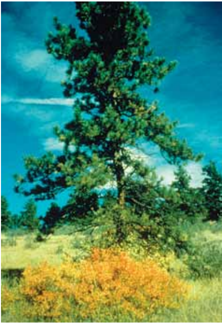
Figure 3: Ponderosa pine ( Pinus ponderosa )