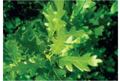
Figure 7: Gambel oak ( Quercus gambelii )