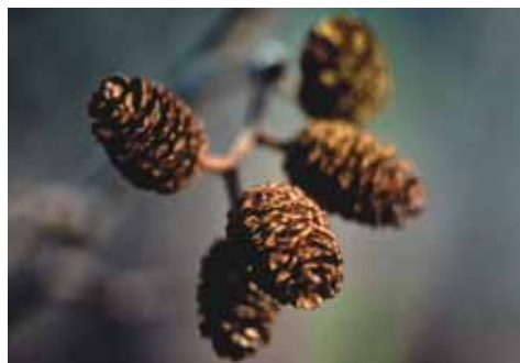
Figure 2: Alder fruit ( Alnus tenuifolia )