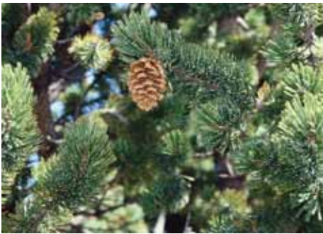
Figure 4: Bristlecone pine ( Pinus aristata )