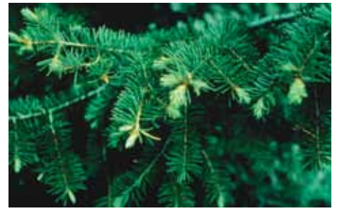
Figure 6: Douglas-fir ( Pseudotsuga menziesii )

The Foothills life zone occurs from 5,500 to 8,000 feet and is dominated by dry land shrubs such as Gambel oak and mountain-mahogany, and in southern and western Colorado, piñon-juniper woodlands and sagebrush. The Montane zone consists of ponderosa pine, Douglas-fir, lodgepole pine, and aspen woodlands at elevations of 8,000 to 9,500 feet. Dense forests of Subalpine fir and Engelmann spruce dominate the Subalpine zone at 9,500 to 11,500 feet. The Alpine zone above 11,500 feet is a treeless zone made up of grasslands called tundra. Species requiring medium to high moisture occur along watercourses throughout all zones.