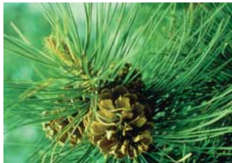
Figure 1: Ponderosa pine cones ( Pinus ponderosa )

There are several factors to consider when designing a native landscape. Due to Colorado's variation of elevation and topography, native plants are found in many habitats. In order to maximize survival with minimal external inputs, trees should be selected to match the site's life zone and the plant's moisture, light, and soil requirements. Even if a plant is listed for a particular life zone, the aspect (north, south, east, or west facing) of the proposed site should match the moisture requirement. For example, a blue spruce, which has a high moisture requirement, should not be sited with plants of dissimilar water needs. Similarly, a blue spruce should not be planted on a south-facing slope, where a significant amount of additional moisture would be required.